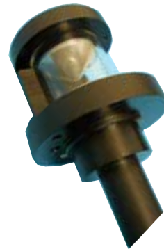
RSL Composite Non-electric Luminaire

All corrosion resistant materials topside.