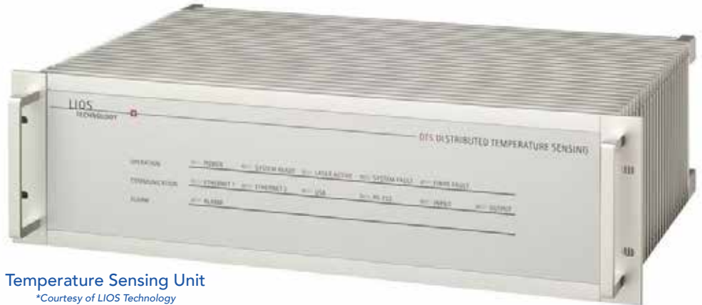
Temperature Sensing Unit

The Distributed Temperature Sensing (DTS) System uses a communications grade fiber optic cable as a continuous linear sensor with a low power laser source to provide real time, multi-point temperature monitoring. The ability to continuously monitor temperature over an extended distance can: