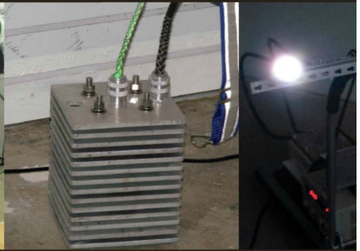
The illuminator in an MSHA approved blast proof box

W hen Bruce Mutter looks out on a classroom filled with students, not all of the faces of the students reflect the typical glow of most teenage college students.