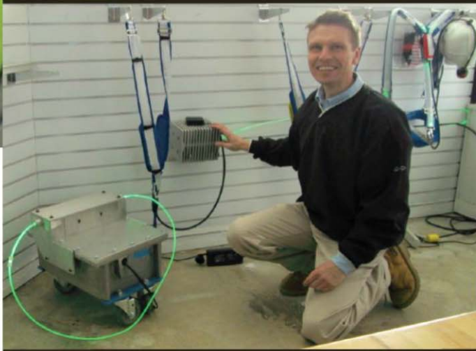
From the first generation illuminator.