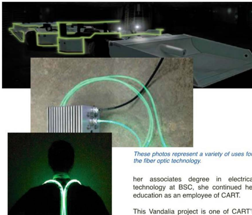
These photos represent a variety of uses for the fiber optic technology.

"That's true," Mutter said. "You can repair it mechanically rather than electrically. A passive fiber optic system has a lot of advantages. There is no power on the lines themselves. These (encapsulated illuminator) connections are in the control room. Everything else in the mine is just two lines of fiber connecting together."