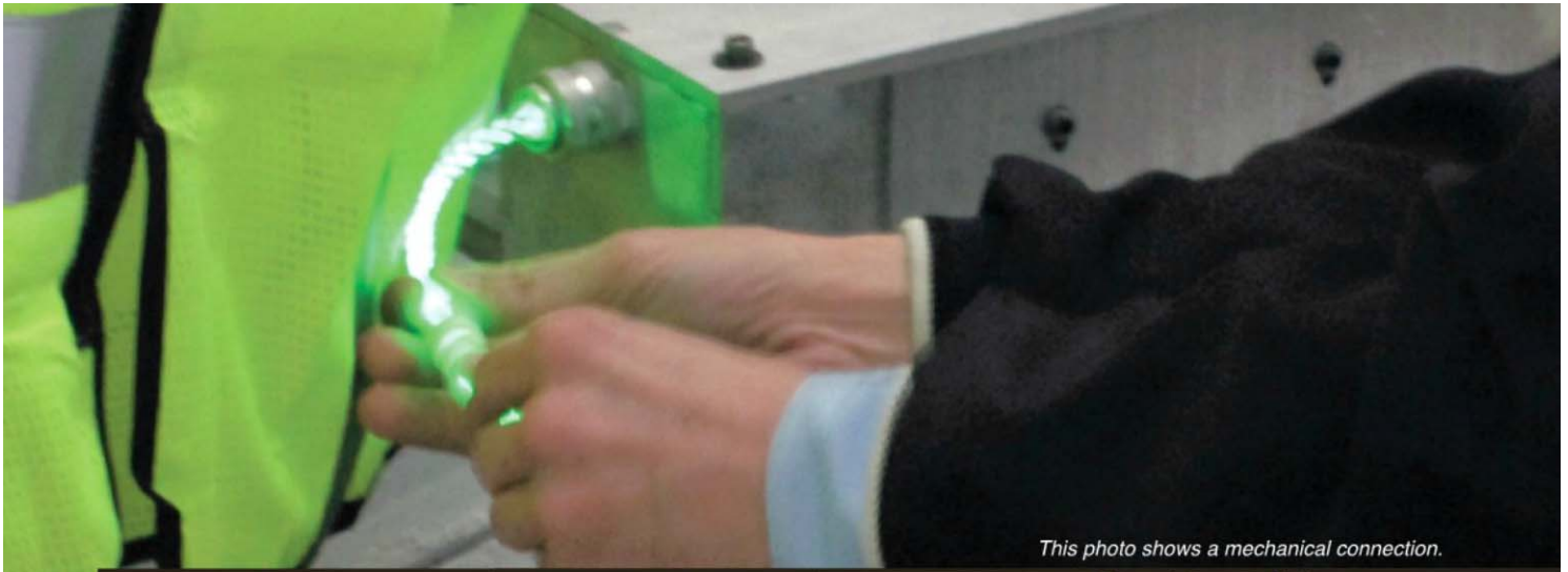
This photo shows a mechanical connection.