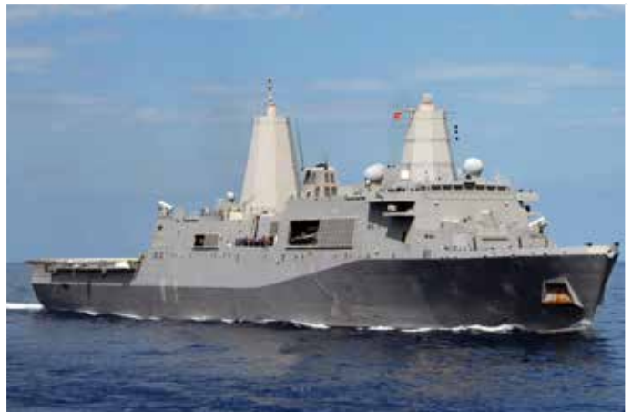
LPD 17 Class