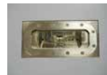
Waterline Security Luminaire