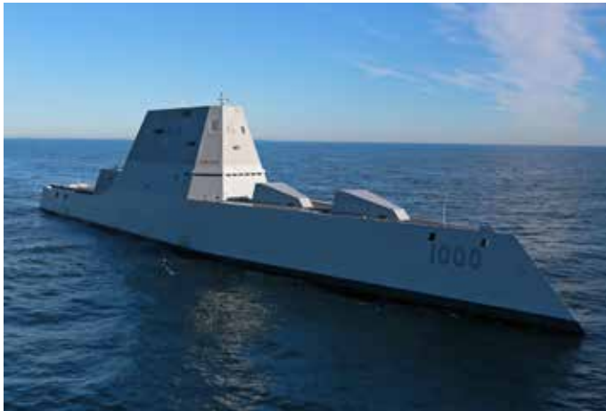
DDG 1000 Class

RSL Fiber Systems is the sole source provider of remote source lighting systems for the United States Navy and the Italian Navy. Since 2005, we have installed more than 50 remote source lighting systems on U.S. Navy vessels including the DDG 1000 Class, the LPD 17 Class, the Italian FREMM Class, and the USNS Invincible.