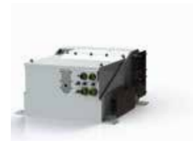
LED or Metal Halide Illuminator