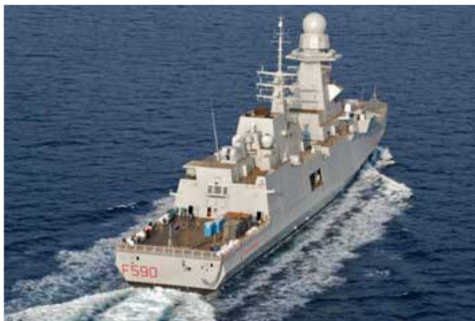
Italian FREMM Class